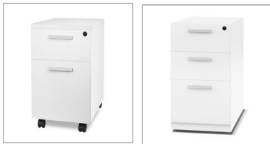
2-drawer Mobile Pedestal and 3-drawer Fixed Pedestal 两抽活动桶柜及三抽固定桶柜