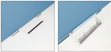
Aluminum Cable Flip Top and Built-in Added Power Modules 铝翻盖及内置外加电源模块