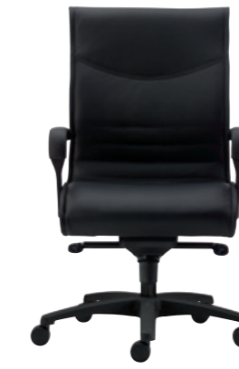
Mid back chair w/ fixed armrests, black base 中背椅，带固定扶手，黑色五星爪