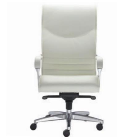
High back chair w/ fixed armrests, polished aluminum base 高背椅，带固定扶手，磨光铝合金五星爪