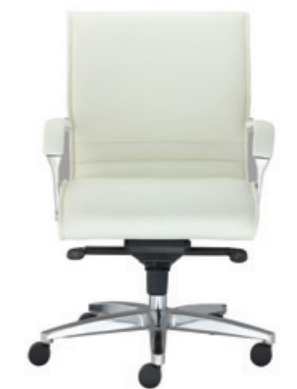
Low back chair w/ fixed armrests, polished aluminum base 矮背椅，带固定扶手，磨光铝合金五星爪