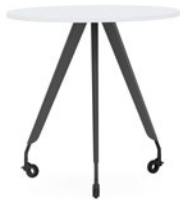
Round Table with Castor 圆桌带脚轮