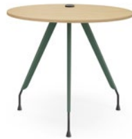
Round Table with Glide 圆桌带平脚