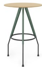
Round High Table 圆型高桌