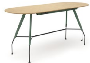
Oblong High Meeting Table 椭圆形洽谈高桌