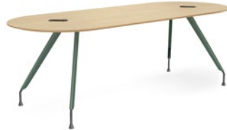
Oblong Meeting Table 椭圆形洽谈桌