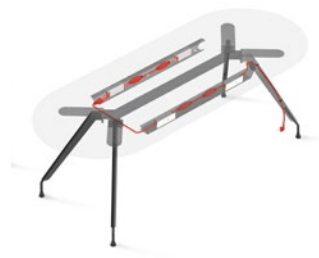
Power Management for Socket Beam 插座梁电源管理