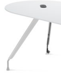
LX2 Socket and Cable Management LX2 走线管理