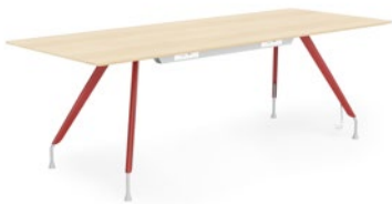
Rectangular Meeting Table 矩形洽谈桌