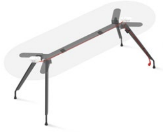
Power Management for LX2 LX2 电源管理